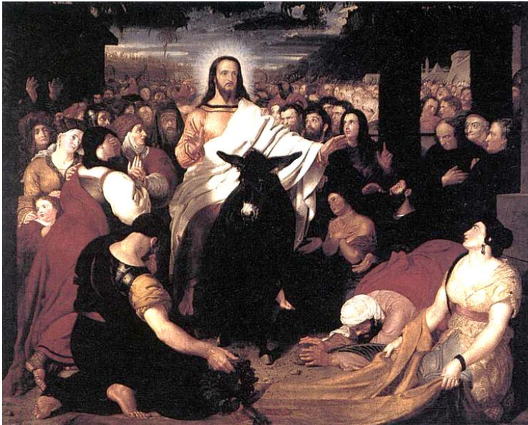
Christ's Entry into Jerusalem , Benjamin Haydon, c. 1818 Athenaeum of Ohio – a Roman Catholic Seminary in Cincinnati