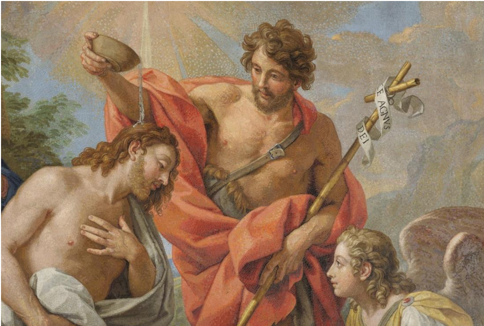
Baptism of Christ (detail), Alessio Mattioli, Mattia Moretti, c. 1752 The Misericórdia Museum, Lisbon

Saint Thomas's Anglican Church 383 Huron Street, Toronto, Ontario M5S 2G5 416-979-2323 www.stthomas.on.ca office@stthomas.on.ca