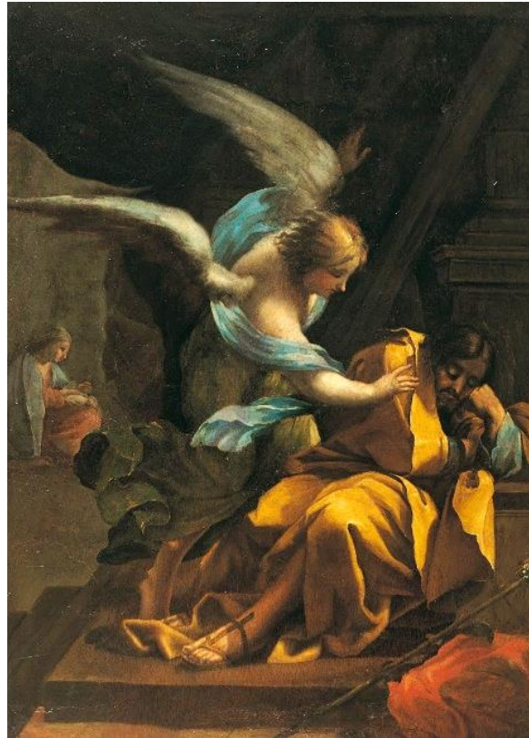
Saint Joseph's Dream , Francisco Goya, c. 1772 Museo de Zaragoza, Spain

Saint Thomas's Anglican Church 383 Huron Street, Toronto, Ontario M5S 2G5 416-979-2323 www.stthomas.on.ca office@stthomas.on.ca