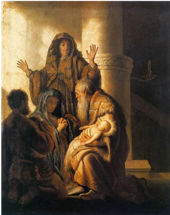
Simeon and Anna in the Temple, Rembrandt Harmensz. van Rijn, 1627 Hamburger Kunsthalle, Hamburg, Germany