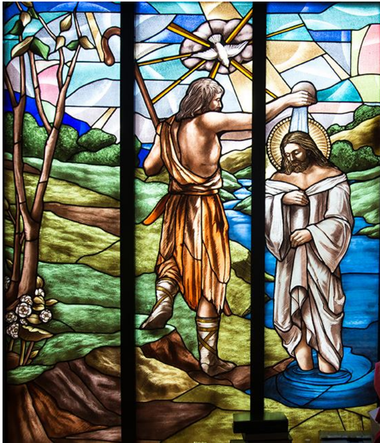
The Baptism of Jesus , stained glass window by Josef Aigner St. Joseph the Worker Church, Thornhill, Ontario