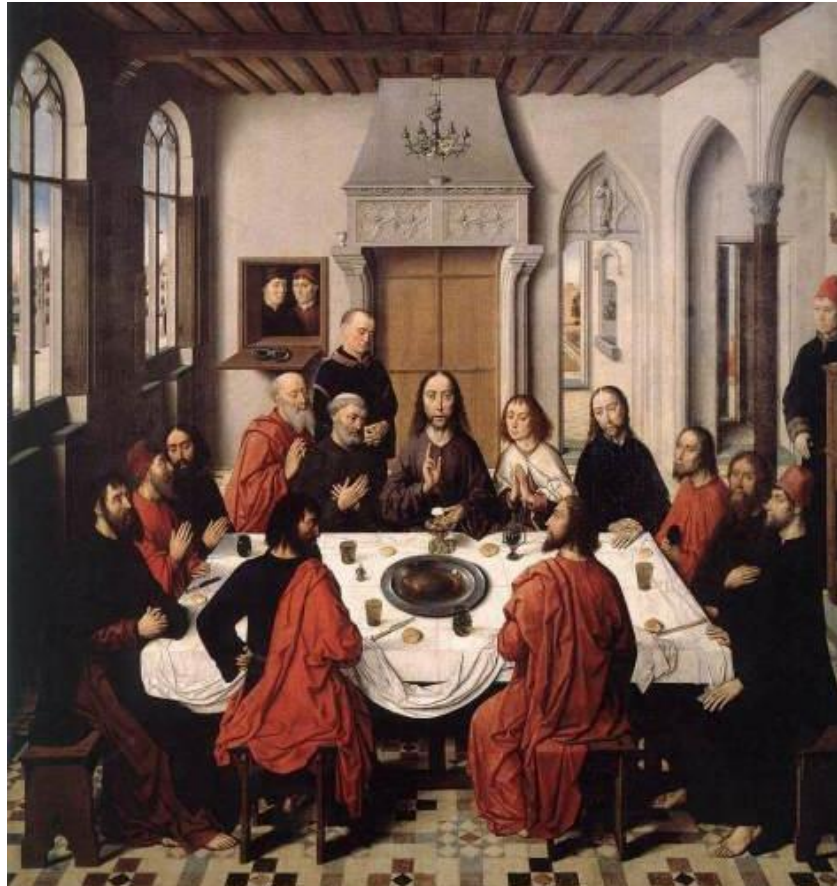
The Last Supper, Dieric Bouts 1466 St. Peter's Church, Leuven, Belgium