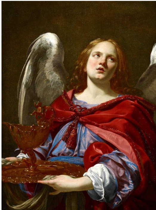
Angel holding the vessel and towel for washing the hands of Pontius Pilate, Simon Vouet, 1627 Minneapolis Institute of Art