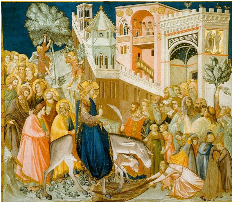
Christ's entry into Jerusalem, Pietro Lorenzetti (c. 1320) Basilica of San Francesco d'Assisi