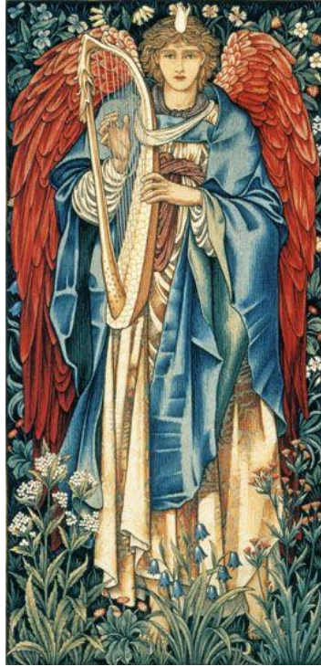
Alleluia, Sir Edward Coley Burne-Jones, 1899 Harris Art Gallery, Preston, United Kingdom

Saint Thomas's Anglican Church 383 Huron Street, Toronto, Ontario M5S 2G5 416-979-2323 www.stthomas.on.ca office@stthomas.on.ca