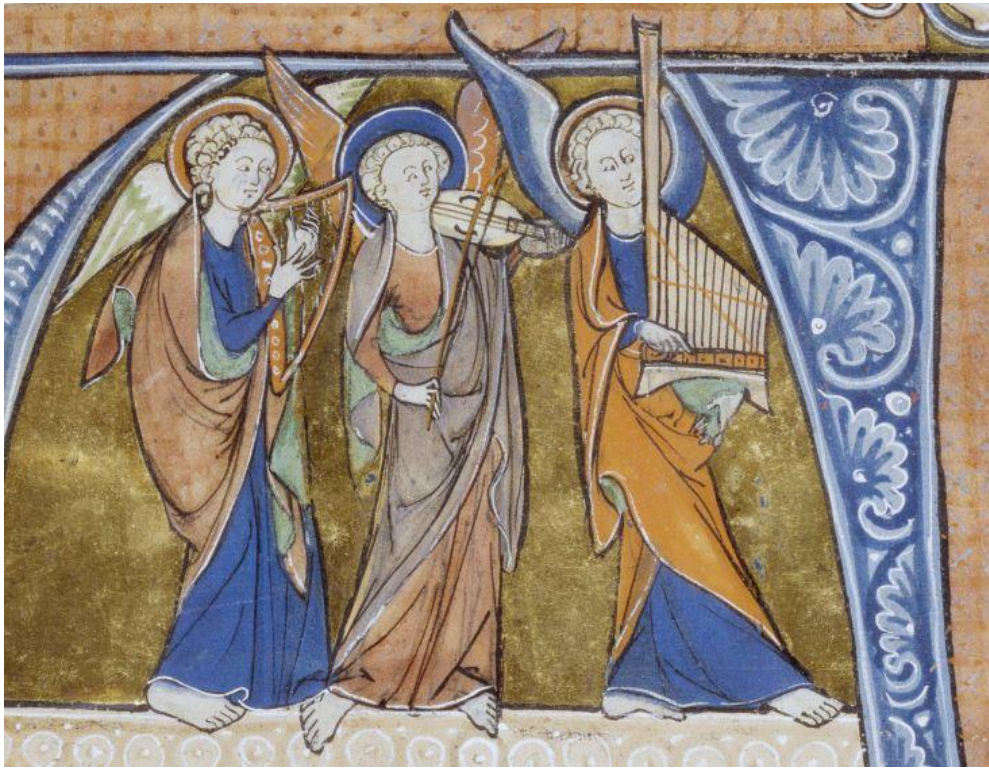
Detail of an Initial from a Flemish illuminated manuscript, c. 1290 Hainaut Museum, Belgium

Saint Thomas's Anglican Church 383 Huron Street, Toronto, Ontario M5S 2G5 416-979-2323 www.stthomas.on.ca office@stthomas.on.ca