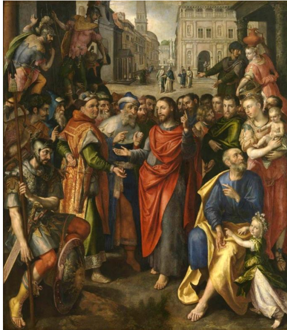
Render unto Caesar, Maerten de Vos, 1602 Altarpiece of the Guild of the Minters Royal Museum of Fine Arts, Antwerp, Belgium

Saint Thomas's Anglican Church 383 Huron Street, Toronto, Ontario M5S 2G5 416-979-2323 www.stthomas.on.ca office@stthomas.on.ca